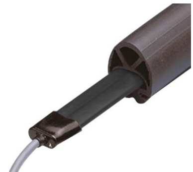
ENT-R assembly with end piece ENEH-Kx in rubber profile